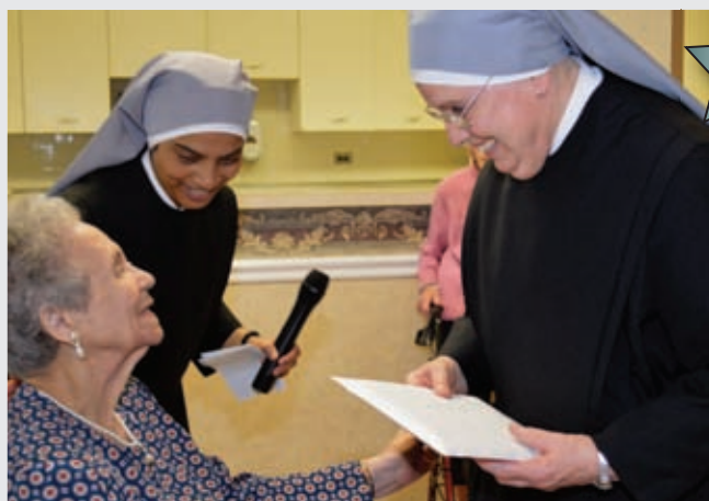
QUEEN OF PEACE

Mother General's last stop was New York, where our travelers visited St. Ann's Novitiate and Queen of Peace Residence in Queens Village, New York.