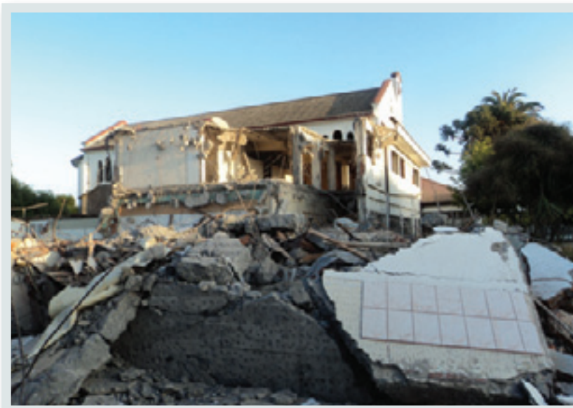
The home in Concepción, just before demolition on January 4, 2011.

The news brought joyful tears to the Residents of Concepción who are currently residing in Osorno. Many elderly poor who stayed in Concepción and lost their few belongings also rejoiced, and per-