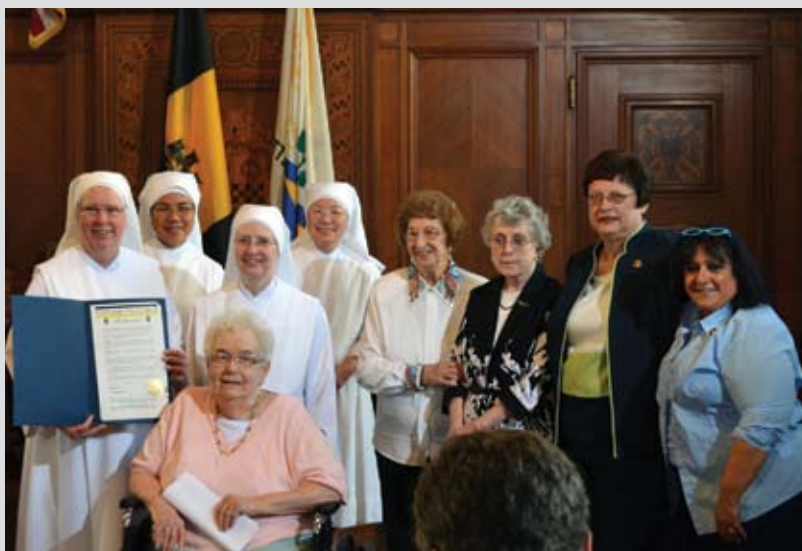
Above: The delegation of Little Sisters, Residents and friends receives the proclamation recognizing the Little Sisters' 140 years of service in Pittsburgh.