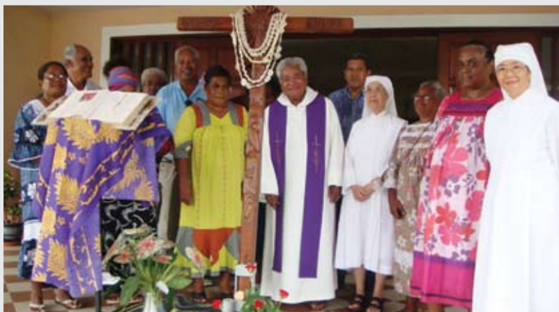
Top: The Little Sisters welcome the Cross and Bible to our home in March. The Cross is intricately carved from local wood.